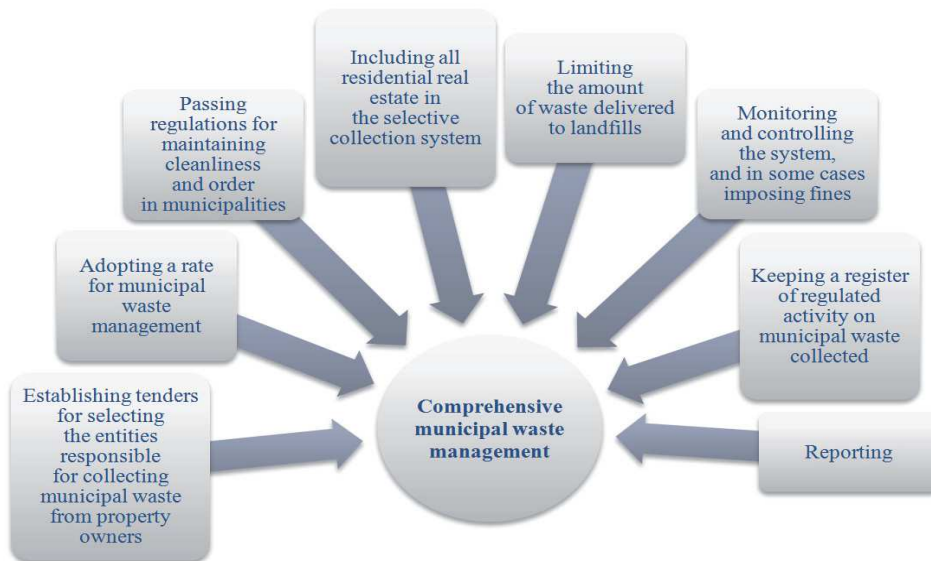
FIG. 3. Municipal waste management system activities in the administered territory

belonging to the association. In this case, changes in the association's statute and a detailed determination of its competences are necessary [Milewska and Czaban 2014]. The Act on maintaining cleanliness and order in municipalities specifies in detail the tasks the municipality is charged with carrying out. It puts at the disposal of the municipal council and its executive bodies a number of legal, economic, oversight and remedial instruments with which it can create a waste management system on the territory it administers. An illustration of this comprehensive toolset is presented in Figure 3.