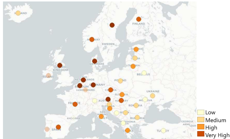
Figure 4. Spatial Distribution of Globalisation

lower numbers of cases includes only Turkey. Hungary, Moldova, Poland, Romania, Slovak Republic, Ukraine, Belarus, Latvia, Lithuania, and Estonia form the LL region which has a low number of cases.