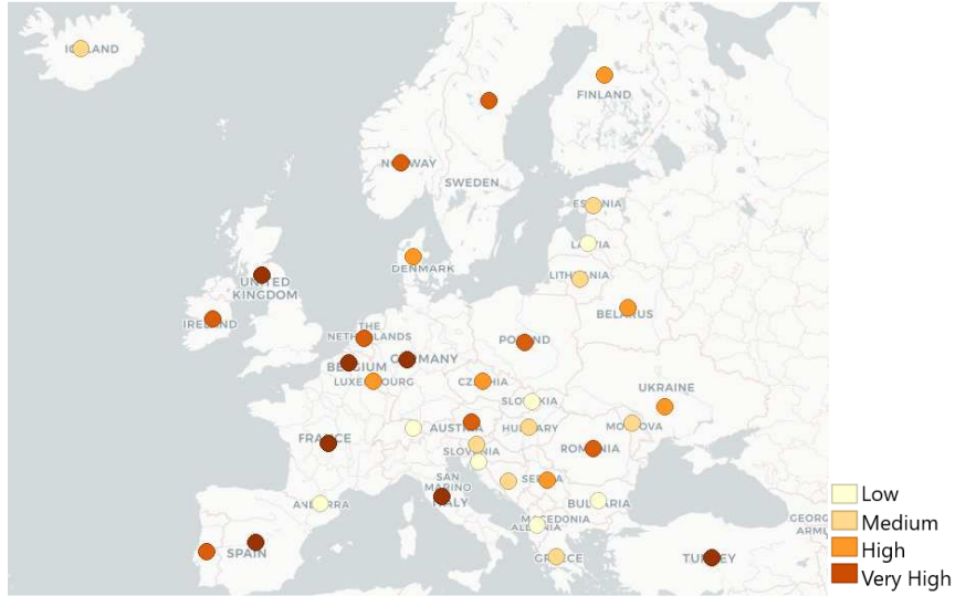
Figure 1. Spatial Distribution of Covid-19 Cases Data Source: CSSE, Johns Hopkins. "2019 Novel Coronavirus Covid-19 (2019-Ncov) Data." (2020).

Spatial distribution map of Covid-19 cases is given below in Figure 1. The darkest colour demonstrates the countries with the highest number of cases. Countries marked with less dark and light colours are observed to form a cluster as demonstrated in Figure 1. Taking this into account, it can be suggested that spatio-sequential dependence exists visually.