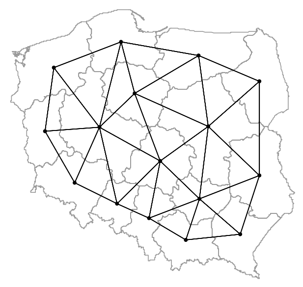
Fig. 1. Neighbourhood structure of Polish voivodeships

The matrix of spatial weights was constructed on the base of object's neighbourhood presented in Figure 1<sup>3</sup>.