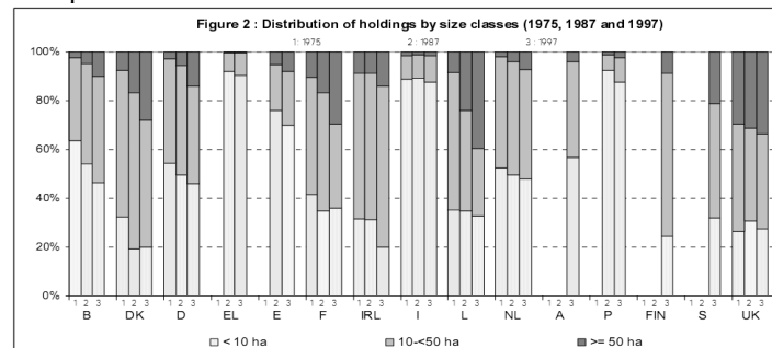
Figure 2: Distribution of holdings by size classes (1975, 1987 and 1997), %

the international market trends. Contrarily to these views, other hypotheses were trying to prove the necessity of the preservation of smaller size farms. They said that middle and large size farms automatically find their place in economy, and by keeping the smaller farms alive, the structure of agriculture will not move towards the interest of the over-financed mammoth farms, which would force down the prices of the raw materials by excessive industrial production.