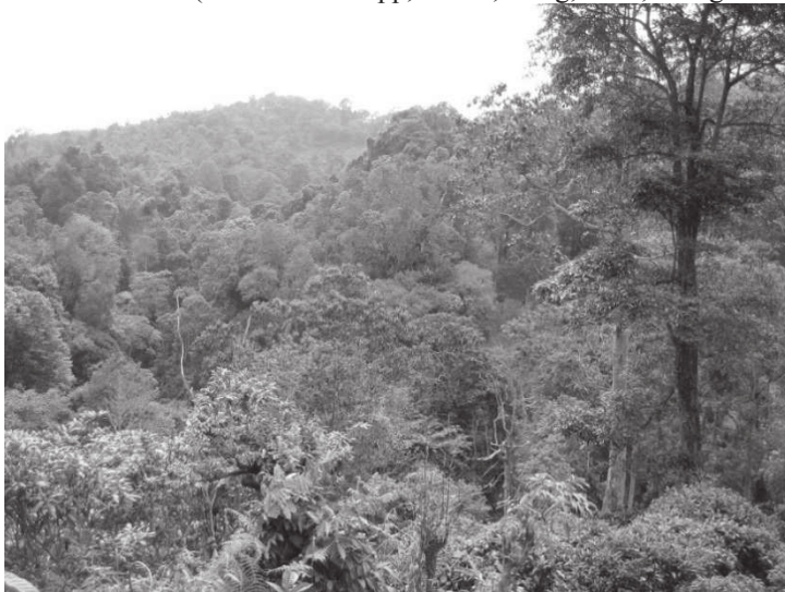
Fig. 3. Diversified structure of forest crops

development of epiphytic vegetation. The area looks natural, and it is a habitat for local animals and vegetation. The cultivation does not erode the soil. Plants have access to rich, adequately nourished and aerated soil. Thanks to the surroundings of other plants varying in height, tea plants are protected from intense climate change. The surrounding vegetation is a kind of “buffer”. This solution was already piloted in 2011 in the Mangjing area of Yunnan. Even though farmers’ earnings have diminished considerably, they have seen an opportunity to recreate the local ecosystem. This solution is now a new direction of change propagated by local authorities (Ahmed and Stepp, 2013b; Hung, 2013; Wang et al., 2017).