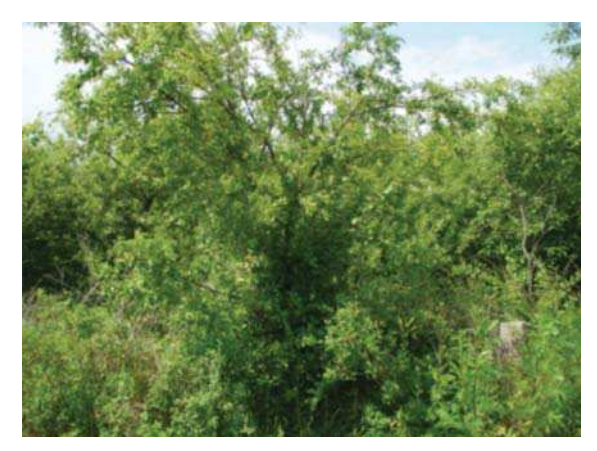
FIG. 2. 30-year-old multi-strain apple orchard, weeds preventing movement, protective cuts not made for a long time

actually organic. SAO estimated that fruit was sold as organic by only 3–5% of the areas inspected. Most growers (13) declared that when the RDP 2007–2013 came to a close, organics would be liquidated. This was because a large part of the controlled cultivation was established in areas that were thoroughly unsuitable for this purpose (the soil was too dry or wet), and the minimum agricultural measures had not been taken (fencing, protection against animals, elimination of weeds). Examples of such crops are depicted in Figures 2 and 3.