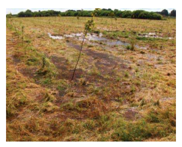
FIG. 3. The cultivation of apple trees, wetlands, on neighbouring meadows. No fence. Trees destroyed by animals

Source: SAO, Information on the results of controls "the use of public means for the cultivation of fruits and berries under the agri-environmental programme".