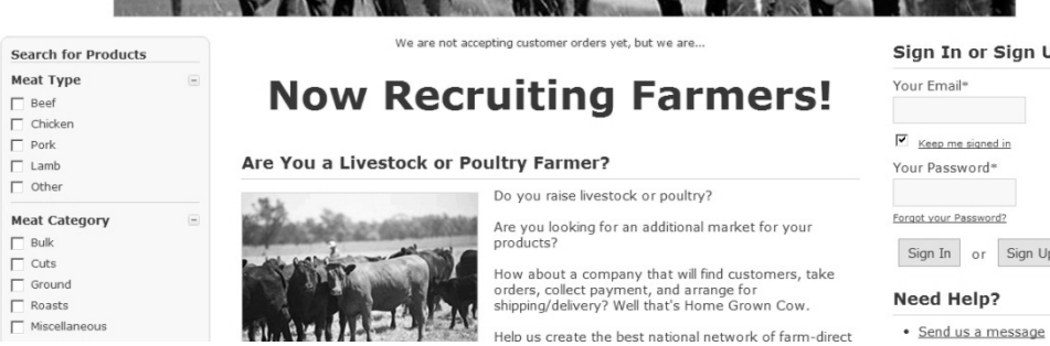
Figure 4. The website of Home Grown Cow