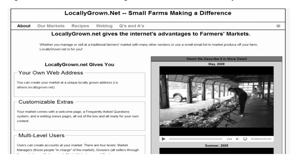
Figure 5. The website of electronic agricultural farmer's market Locally Grown

quality. The products offered on the Locally Grown e-marketplace are produced right on the local areas in Rabun, Habersham and adjacent counties. The online marketplace is not a cooperative, though farmers taking part in the e-market use cooperative efforts to increase the availability of local food products to the local consumers. Promoting the online marketplace farmers inform local citizens that the electronic farmers' market provides many benefits to the local community. It builds local economy because small farms increase economy with relatively low capital costs. Anybody who grow plants and produce food without the use of chemicals could become a vendor of products to the electronic market. Buying food products on this Internet market also contributes to reduction of the environmental impact of producing food products. It is also connected with reduction of chemical, fuel and packaging materials usage. Moreover, better understanding of origins of the offered food may influence many positive behaviors of consumers.