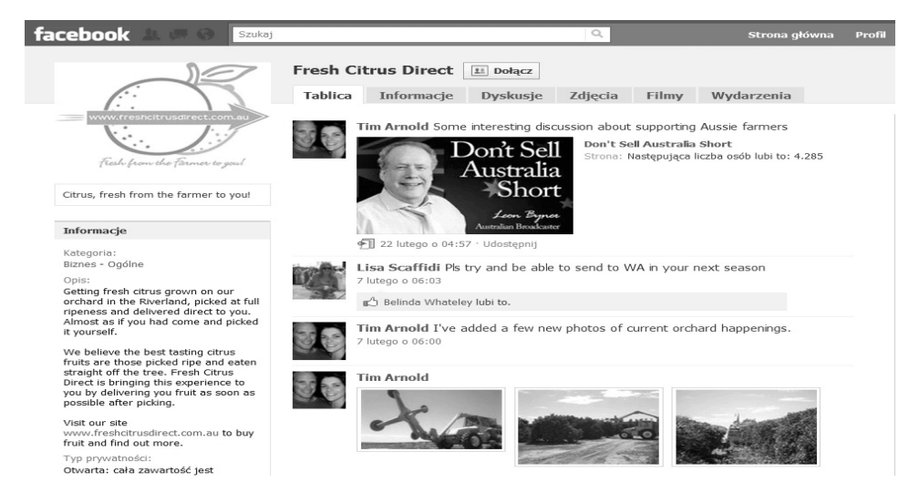
Figure 3. The Facebook group created by the citrus fruit producer

The electronic fruit store is also supported by the social media marketing. Figure 3 presents Facebook group of the citrus producer.