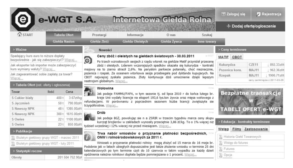
Figure 6. The website of IGT electronic platform

In Poland the most developed and complex electronic exchange of agricultural commodities is IGT electronic platform (www.ewgt.pl). Figure 6 presents the IGT website.