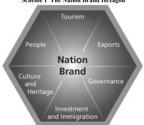
Scheme 1 The Nation Brand Hexagon

Each country's score across these six dimensions is succinctly captured in the Nation Brand Hexagon. [1]