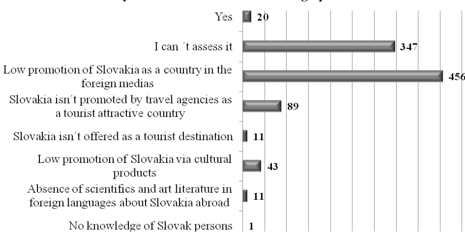
Scheme 4 Do you think that Slovakia is enough promoted abroad?

On scheme 4 we can see the position of the Slovak respondents on how the country is promoted abroad. 47% of Slovaks believe that Slovakia has a lack of publicity in international media. Up to 35% of Slovaks were unable to assess their views on this issue. Mainly because of the fact the Slovaks are mostly simple people, which are incomparable with the tourist experiences of other citizens of the world. Therefore they do not know whether Slovak products are on store shelves in stores, whether is any agency in any major city and offers "last minute" to Slovakia, or sold in bookstores books about the country, whether or not students learn the geography and that Slovakia is also part of Europe. Slovaks awareness is reflected in their opinion that their country is not offered in travel agencies, as a tourist destination and also that there is a lack of promotion of Slovak cultural products. Just a lot of Slovaks describe its attributes as an agricultural country, corrupt or romantic folklore.