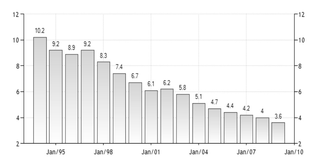
Chart 1 Employment in agriculture (% of total employment) in Slovakia