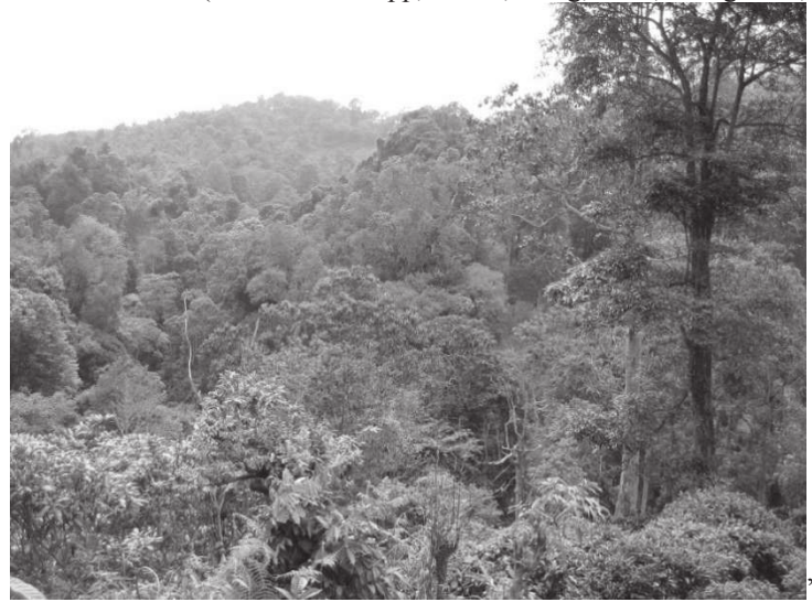
Fig. 3. Diversifed structure of forest crops

development of epiphytic vegetation. The area looks natural, and it is a habitat for local animals and vegetation. The cultivation does not erode the soil. Plants have access to rich, adequately nourished and aerated soil. Thanks to the surroundings of other plants varying in height, tea plants are protected from intense climate change. The surrounding vegetation is a kind of "buffer". This solution was already piloted in 2011 in the Mangjing area of Yunnan. Even though farmers' earnings have diminished considerably, they have seen an opportunity to recreate the local ecosystem. This solution is now a new direction of change propagated by local authorities (Ahmed and Stepp, 2013b; Hung, 2013; Wang et al., 2017).