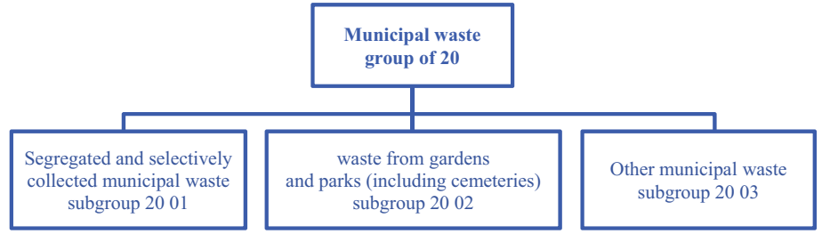
FIG. 1. The division of municipal waste