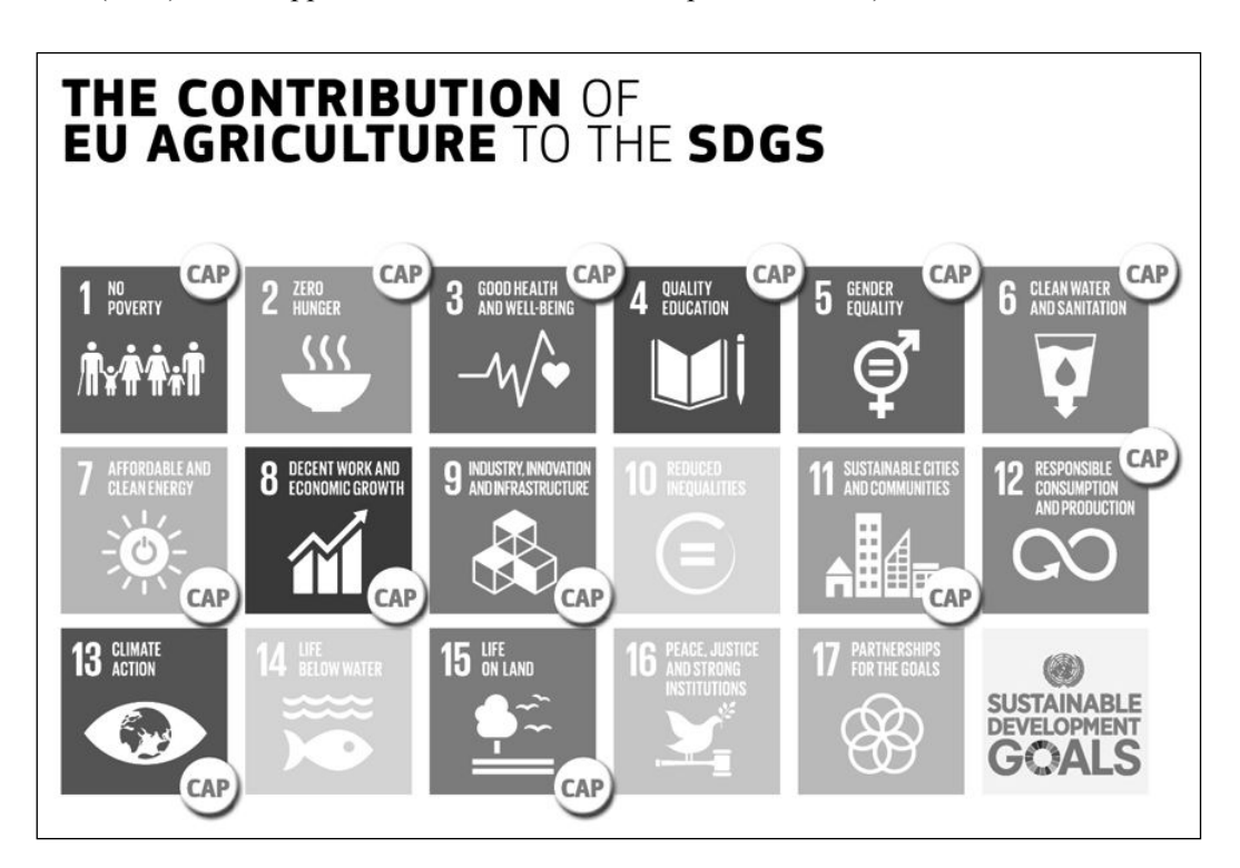
Figure 1. Sustainable development goals

Generally, European Added Value means an added value (benefits) derived from actions (policies) implemented at the European level compared to the effects which would be achieved by separate policies of individual Member States within a given area (RAND Corporation, 2013).