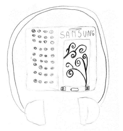
Figure 2. Drawing of Child from class IV – VI