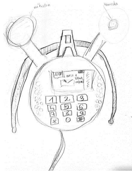
Figure 4. Drawing of Child from Secondary School

Analyzing the first stage of making drawings it can be seen that the brand awareness among children is high. In most cases there dominated drawings, which concerned the specific brands of phones. This was evident by drawing the logo and its components. Moreover, it was underlying in children talks. There was also a difference noted between the drawings of children from primary school and high school. While the first ones drew only smartphones, the children of the secondary school drew the older generation phones, even with the antenna.