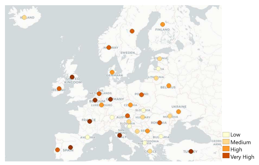
Figure 1. Spatial Distribution of Covid-19 Cases

Spatial distribution map of Covid-19 cases is given below in Figure 1. The darkest colour demonstrates the countries with the highest number of cases. Countries marked with less dark and light colours are observed to form a cluster as demonstrated in Figure 1. Taking this into account, it can be suggested that spatio-sequential dependence exists visually.