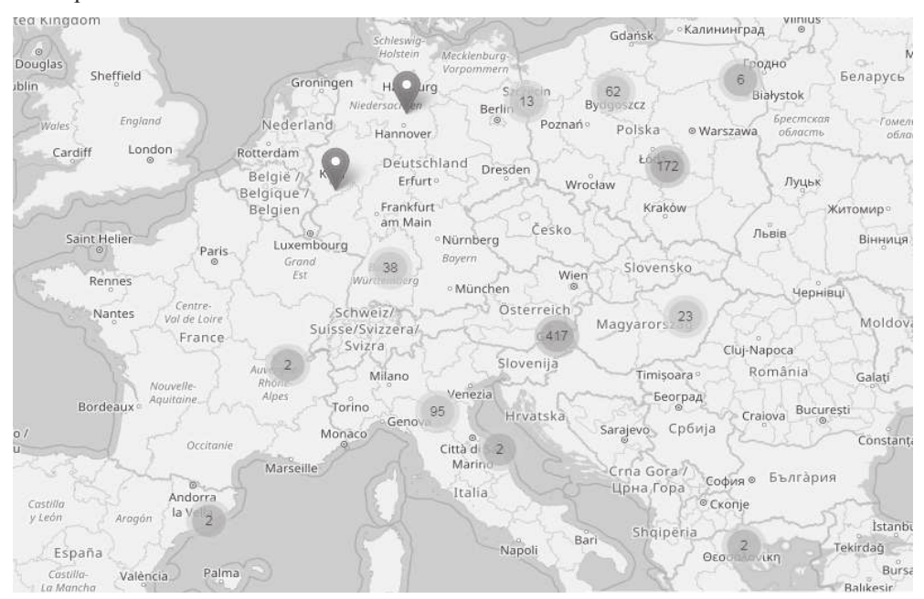
Fig. 1. A map of food technology, food design and food safety providers (2017)

The innovations were implemented by using service providers identified within the framework of the research. The map shows the geographical positioning of food service providers in the field of food safety mechatronics and packaging design (Fig 1). This tool supports enterprises enabling finding a suitable service provider using various criteria (country, sector, type organization, scope of services provided). The numbers in circles represent the numbers of food technology, food design and food safety providers in a given country or region. Visual presentation of data can facilitate planning and strategic action for the implementation of innovation in the EU.